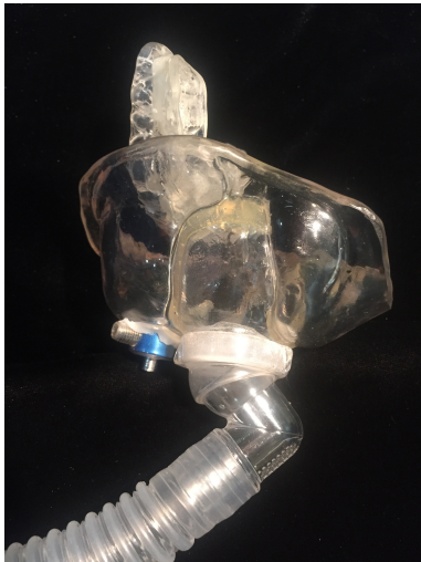
Figure 1 —Custom face mask with completed fabrication and ready for insertion.