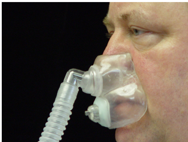
Figure 3 —TAP-PAP CM on face features custom face mask attached to mandibular advancement splint.

This photograph is used with the consent of the patient pictured.